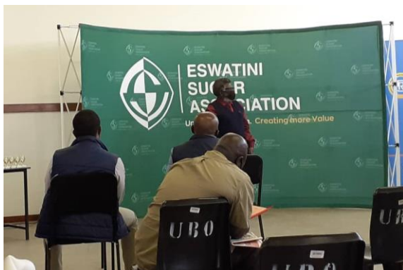
Cane Grower Competition 2020.