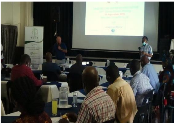
Annual General Meeting of 2020, at Mhlume Country Club.

As a result of the cooperation the meeting was held with quorum of each Planters' Group. Key resolutions on audited financial statements and new budget and levy were taken to enable functionality of the Association during the 2021/22 Financial Year.