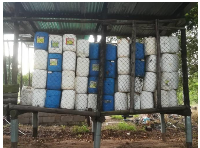
Figure 4. Containers collected for disposal.

Now that all the containers that had accumulated over years have been disposed, there is a need for a coordinated approach to make sure that collection centres are identified and the frequency of collections is set and communicated with recyclers.