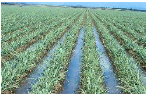
Figure 3. Sugarcane irrigation methods.

In an attempt to assist the VIF growers with their water challenge, a water working group has been formed. The group consists of representatives from the following entities; VIF growers, Mhlume Planters Group leadership, ECGA Office, Eswatini Sugar Association Technical services, Extension Office and Mhlume water. Some of the challenges are caused by poor irrigation scheduling and water management. The team decided on having a pilot project on irrigation scheduling with 5 growers to demonstrate that it is possible so that the other growers can learn from their peers. ESA TS irrigation team and the Extension officer responsible are leading the project. The ECGA office commends the growers who have volunteered to be part of this project and hopes that they will see the benefit both in the short and long term.